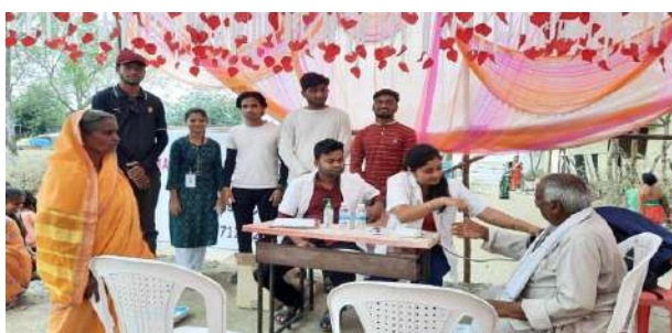
Health check -up camp especially for women and villagers