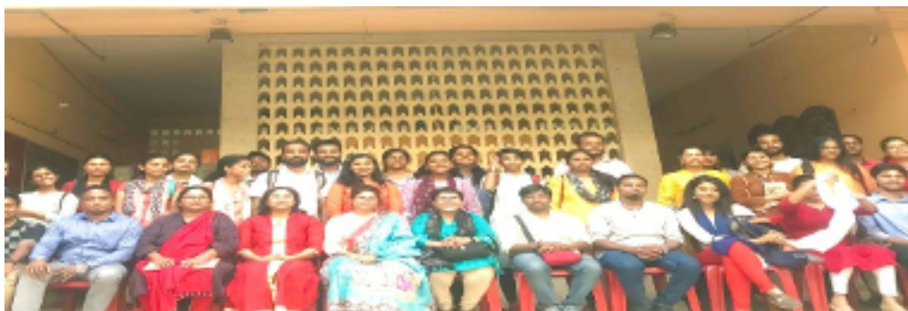
A Group of Students and faculties from The Nirmala Niketan School of Social work, Mumbai visited the institute