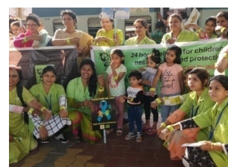
CHILDLINE Se Dosti Week Rally at Nagpur Railway Station

'CHILDLINE Se Dosti Week programme' was organized during November 14-20, 2019 by Nagpur CHILDLINE 1098. The programme was inaugurated with sensitization rally at Nagpur Main Railway station. CHILDLINE posters & leaflets were distributed among passengers and stalls owners. CHILDLINE songs, street plays were performed by the team. Several awareness programmes were organized at various parks, schools and communities in collaboration with GOs and NGOs.