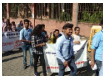
MSS unit of MSSISW participated in the Samvidhana Rally