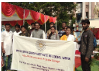
MSS team at Inauguration of Preamble Park